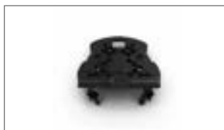
Rear Carrier 2CM-F4841-A0-00