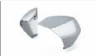
Icon Performance BLT_BBW-F84W1-A0-28