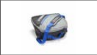
34L Top Case Inner Bag YME-BAG34-00-00