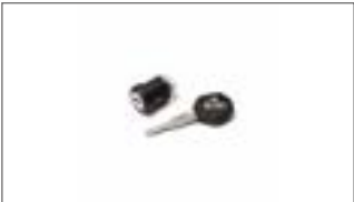
Single Key Lock Set for City Top Cases (compatible depending on unit's keys) 59C-281C0-00-00