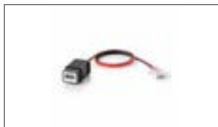
USB Device Charger 5V B4T-H6600-00-00