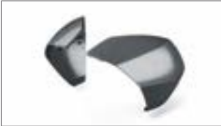
Power Grey BLT_BBW-F84W1-A0-16