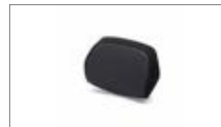
Passenger Backrest Cushion BV1-F843F-30-00