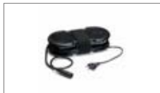
Battery Charger BFM-HC2A1-00-00