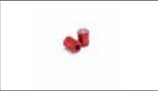
Aluminium Valve Cap Knurled Pattern 90338-W1016-RE