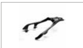
Rear Carrier B74-F48D0-00-00