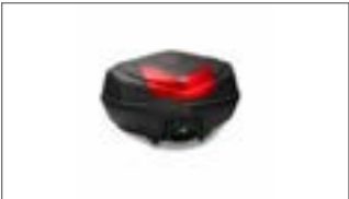
50 L Top Case City 34B-F84A8-10-00