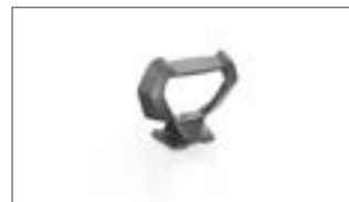
Passenger Backrest Stay 2CM-F84U0-00-00