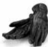
Urban Leather Gloves Women A22-GL201-B0-0M