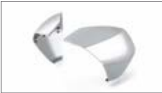
Icon Performance BLT_BBW-F84W1-A0-24