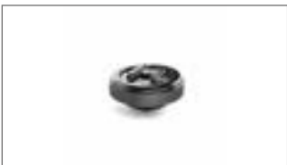
SP Connect™ Anti Vibration Module YME-FAVM0-00-00