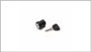
Top Case Lock Set - Standard Operation 52S-21780-09-00