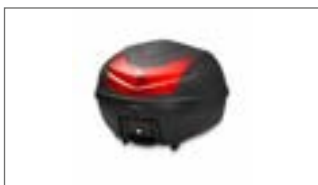
39 L Top Case City 525-F84A8-00-00