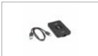
Wireless Charging Module YME-FWIRE-00-00