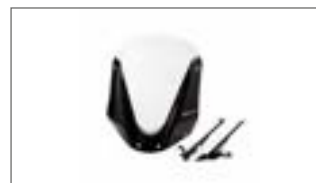
High Screen Tricity BB8-F83J0-20-00