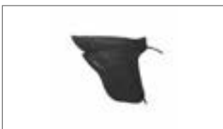
Apron Tricity 2CM-F47L0-00-00