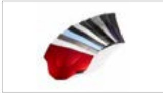
39L Top Case City Coloured Lid Panel 52S-F842M-00-00