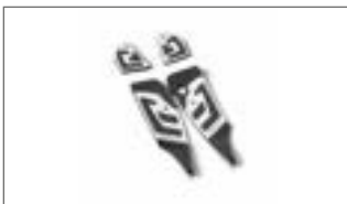
Foot Panel Set BX9-F74M0-00-00