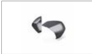
Top Case Coloured Plate Set BBW-F84W1-A0-16