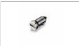
USB Adaptor YME-FUSBA-00-00