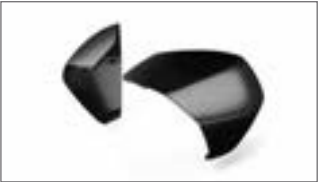
Midnight Black BLT_BBW-F84W1-A0-10