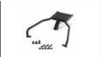
D'elight Rear Carrier B3Y-F48D0-00-00