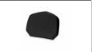
50L Top Case Passenger Backrest 37P-F84U0-B0-00