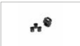
Mirror Mount YME-FMIRR-00-00