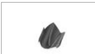
Sports Screen 2CM-F61C0-00-00