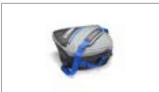
34L Top Case Inner Bag YME-BAG34-00-00