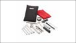
Metric Tool Kit ABA-METRC-00-00