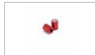
Aluminium Valve Cap Knurled Pattern 90338-W1016-RE