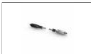
LED Flashers Plus Rear YME-FLB2R-10-00