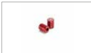
Aluminium Valve Cap Helical pattern 90338-W1018-RD