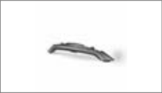
Smoke coloured reflector BBW-F845R-S0-00