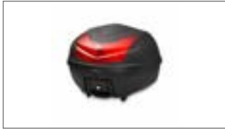
39 L Top Case City 52S-F84A8-00-00