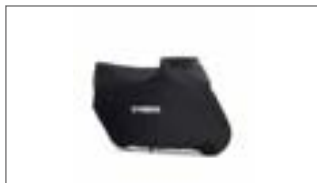
Yamaha Unit Covers Indoor C13-IN101-10-0L