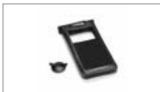
Universal Case YME-FUNVC-00-00