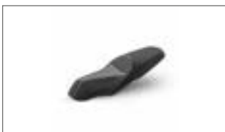
Low seat B74-F47C0-L0-00