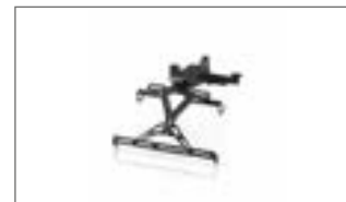
License Plate Holder BX9-F16E0-00-00

Above is a selection of bolt-on accessories available. Please contact your local Yamaha dealer for a full list of accessories and to advise you on the best accessories set-up for your Yamaha. Full list of accessories is also available on our website.