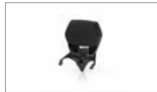
Backrest Base Kit BX9-F84U0-00-00