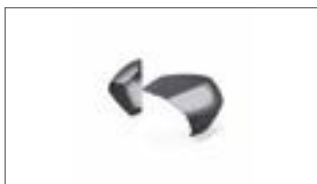
Top Case Coloured Plate Set BBW-F84W1-A0-16