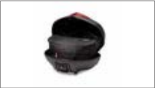
50L Top Case Inner Bag YME-BAG50-00-00