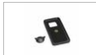
Yamaha Protection Case YME-FCAS9-00-00