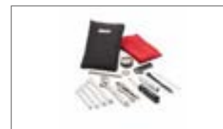
Metric Tool Kit ABA-METRC-00-00