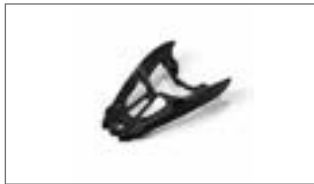
NMAX Rear Carrier B6H-F48D0-00-00