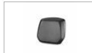
34L Top Case Passenger Backrest BBW-F84U0-00-00