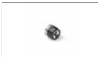
End Grip B9Y-F6246-U0-00