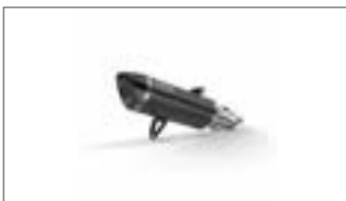
Tricity 300 Akrapovič Black Slip-on muffler 90798-33203-00