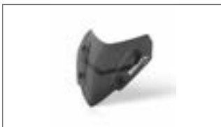
Sport Screen Kit BX9-F83J0-A0-00