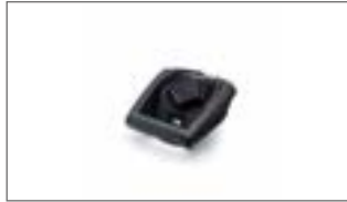
Universal Stay B74-F81A0-10-00