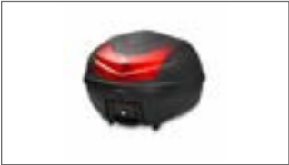
39 L Top Case City 52S-F84A8-00-00