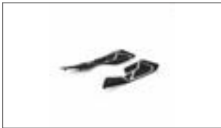
Foot Plates Floor B6H-F74M0-10-00