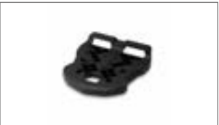
Universal Mounting Plate Top Cases City 37P-F84X0-00-00