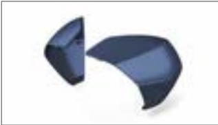
Gun Smoke BLT_BBW-F84W1-A0-12