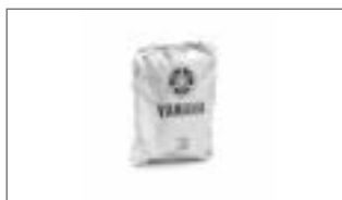
Scooter Saddle Cover 5GJ-W0702-00-00