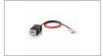
USB Device Charger 5V B4T-H6600-00-00