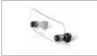
Add-on Screen Wide B3T-F83M0-00-00