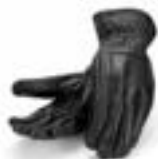
Urban Leather Gloves Men A22-GL101-B0-0L