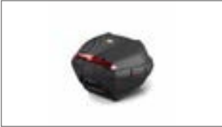
Top Case 34L (Base) BBW-F840E-00-00