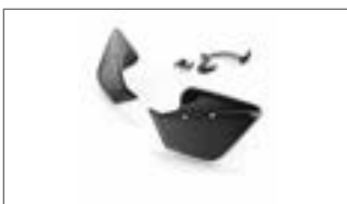
Knuckle Visor Kit BX9-F85F0-00-00