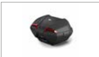
Top Case 45L (Base) BBW-F840E-10-00