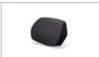
Passenger Backrest Cushion X-MAX 1SD-F843F-00-00