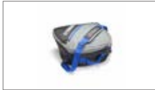
34L Top Case Inner Bag YME-BAG34-00-00