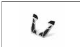
Foot Plates Top B6H-F74M0-00-00