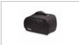
39L Top Case Inner Bag YME-BAG39-00-00