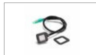
Underseat Storage Light BCS-H54C0-00-00