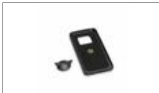
Yamaha Protection Case YME-FCAS9-00-00