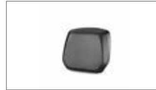
34L Top Case Passenger Backrest BBW-F84U0-00-00