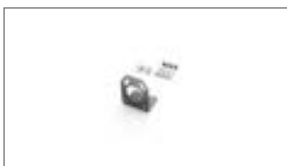
GPS Stay 2CM-F34A0-00-00