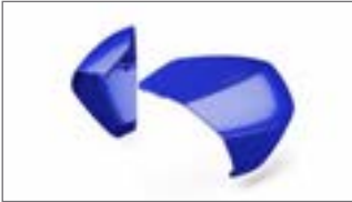
Yamaha Blue BLT_BBW-F84W1-A0-21