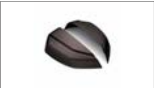
50L Top Case Coloured Lid Panels 34B-F843F-0F-00