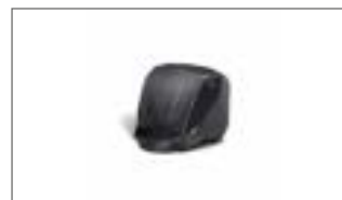
Console Bag B9Y-F0750-00-00