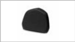
39L Top Case Passenger Backrest 37P-F84U0-A0-00