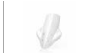
High Screen NMAX B6H-F83J0-00-00