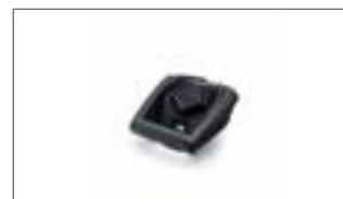
Universal Stay B74-F81A0-10-00