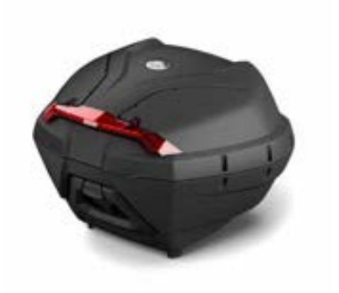
Top Case 34L (Base) BBW-F840E-00-00 - Black