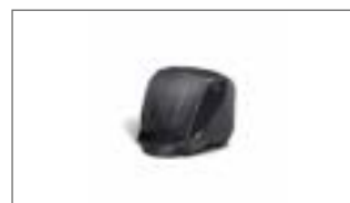
Console Bag B9Y-F0750-00-00