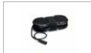
Battery Charger BFM-HC2A1-10-00