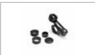
Bar Mount YME-FMKIT-00-02