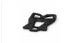
Mounting Plate Top Cases B7N-284X0-00-00