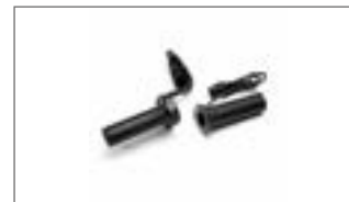
Grip Heater 120 YME-F2960-10-00