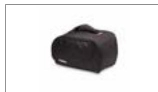
39L Top Case Inner Bag YME-BAG39-00-00