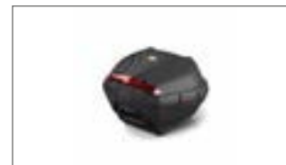
Top Case 34L (Base) BBW-F840E-00-00