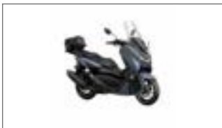
2021 NMAX Urban pack B6H-FVUP0-00-00