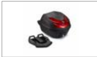
30L City Top Case 2DP-284A8-A0-00