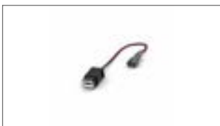
USB charger outlet for TRACER 9 B5U-H6600-00-00