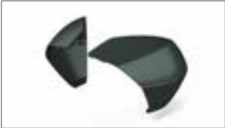
Dark Petrol BLT_BBW-F84W1-A0-17