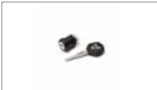
Single Key Lock Set for City Top Cases (compatible depending on unit's keys) 59C-281C0-00-00