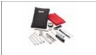
Metric Tool Kit ABA-METRC-00-00