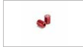
Aluminium Valve Cap Helical pattern 90338-W1018-RD