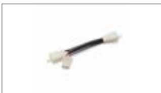
Y-Cable for USB Converter B74-H2553-00-00