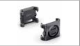
Universal Phone Clamp YME-FUPCL-00-00

Above is a selection of bolt-on accessories available. Please contact your local Yamaha dealer for a full list of accessories and to advise you on the best accessories set-up for your Yamaha. Full list of accessories is also available on our website.