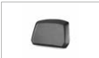
45L Top Case Passenger Backrest BBW-F84U0-10-00