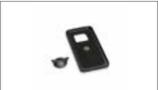
Yamaha Protection Case YME-FCAS9-00-00