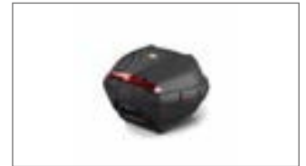
Top Case 34L (Base) BBW-F840E-00-00

Above is a selection of bolt-on accessories available. Please contact your local Yamaha dealer for a full list of accessories and to advise you on the best accessories set-up for your Yamaha. Full list of accessories is also available on our website.