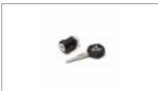
Single Key Lock Set for City Top Cases (compatible depending on unit's keys) 59C-281C0-00-00