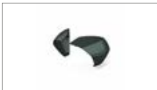
Top Case Coloured Plate Set BBW-F84W1-A0-17