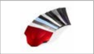
39L Top Case City Coloured Lid Panel 52S-F842M-00-00