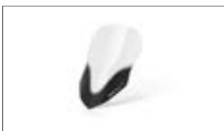
High Screen BX9-F83J0-B0-00