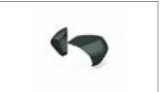
Top Case Coloured Plate Set BBW-F84W1-A0-17