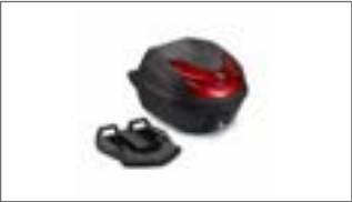
30L City Top Case 2DP-284A8-A0-00