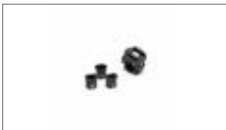
Mirror Mount YME-FMIRR-00-02