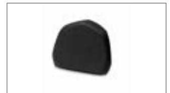
39L Top Case Passenger Backrest 37P-F84U0-A0-00