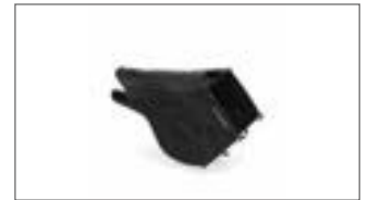
Apron NMAX B6H-F47L0-00-00