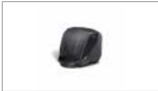
Console Bag B9Y-F0750-00-00