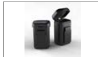
USB Adapter mounting rubber BEA-H21K0-00-00