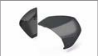
Sword Grey BLT_BBW-F84W1-A0-15