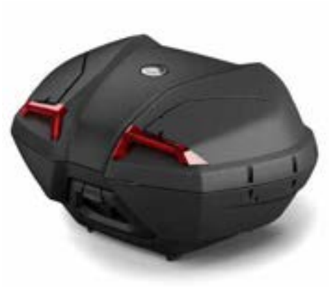
Top Case 45L (Base) BBW-F840E-10-00 - Black