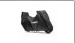
Yamaha Unit Covers Outdoor C13-UT101-00-0L