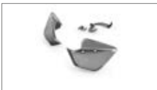
Knuckle Visors BCS-F85F0-00-00