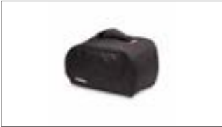
39L Top Case Inner Bag YME-BAG39-00-00