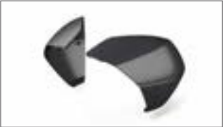
Sonic Grey BLT_BBW-F84W1-A0-18