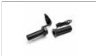
Grip Heater 120 YME-F2960-10-00