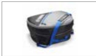
45L Top Case Inner Bag YME-BAG45-00-00