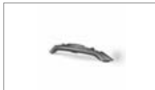
Smoke coloured reflector BBW-F84SR-S0-00