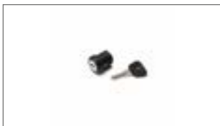
Top Case Lock Set - Standard Operation 52S-21780-09-00