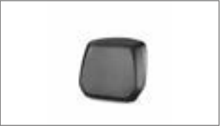
34L Top Case Passenger Backrest BBW-F84U0-00-00