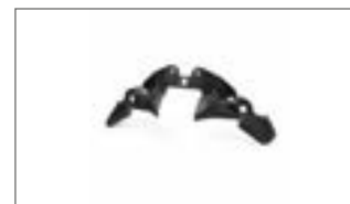
Cover for Licence Plate Holder B74-F163A-00-00