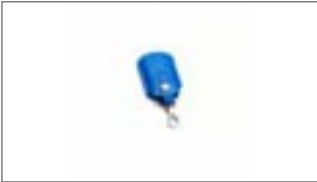
Smart Key Cover 90798-LSKC5-00