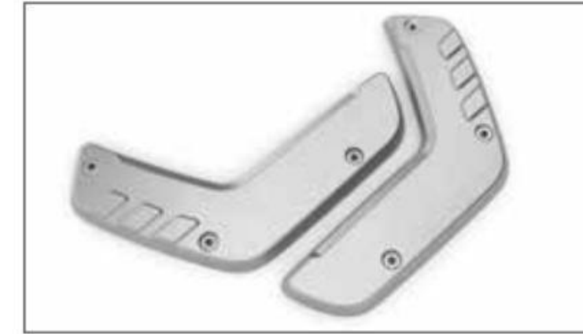
Aluminium Sub Cowl Side Panel Set B1V-SF835-M3-SV