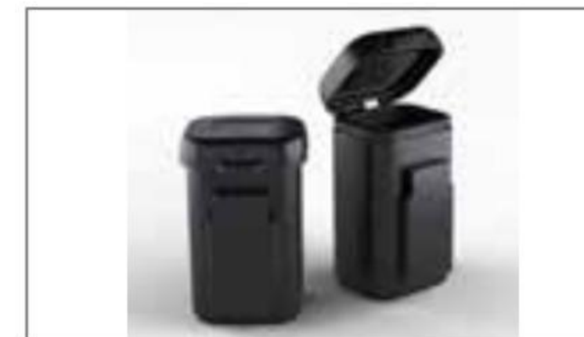
USB Adapter Mounting Rubber BEA-H21K0-00-00