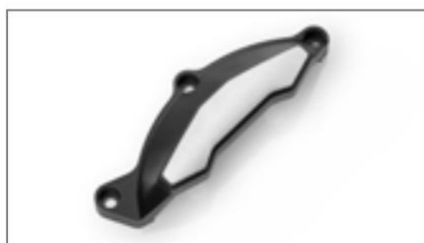
Right Engine Protector B7D-E5411-M3-SB