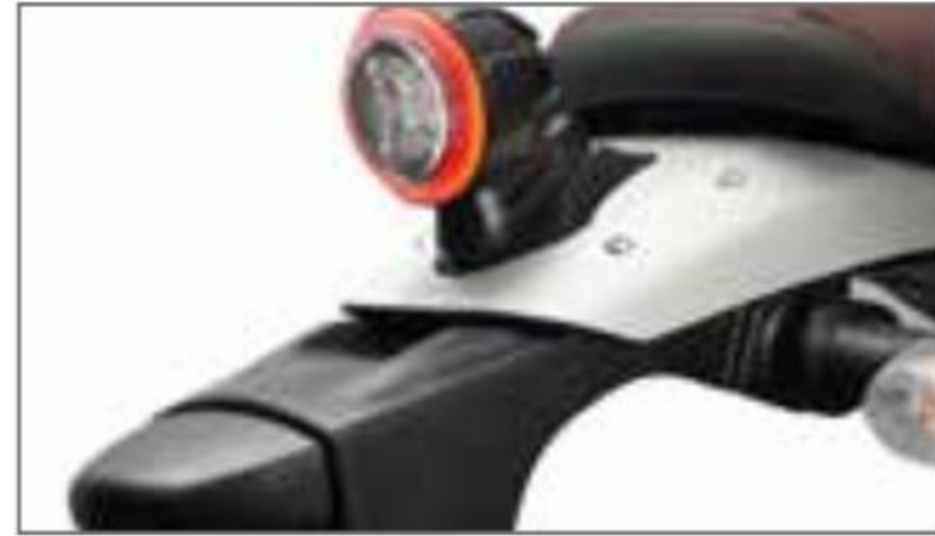
LED Vintech Tail Light YME-FYTL1-00-00