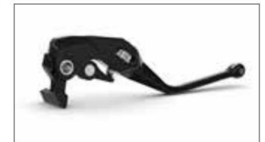
Brake Lever Black B7N-RFFBL-00-00

Above is a selection of bolt-on accessories available. Please contact your local Yamaha dealer for a full list of accessories and to advise you on the best accessories set-up for your Yamaha. Full list of accessories is also available on our website.