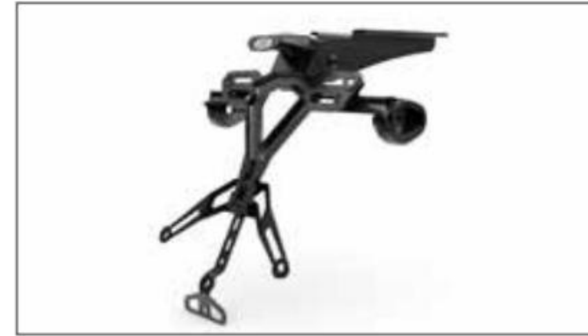
Stylish Licence Plate Holder BFG-F16E0-00-00