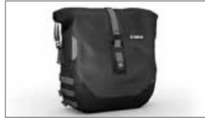
XSR Soft Side Bag Left BJV-FSSBH-L0-00