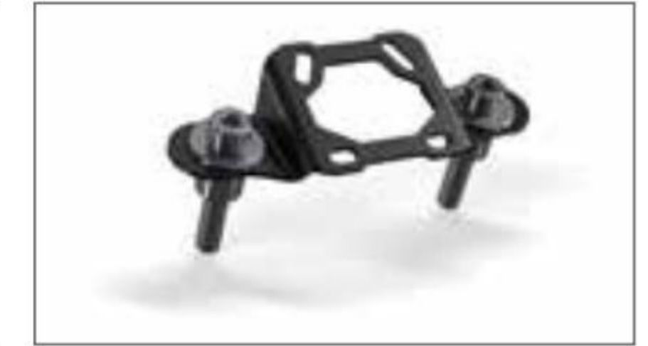
GPS Stay BEA-234A0-10-00