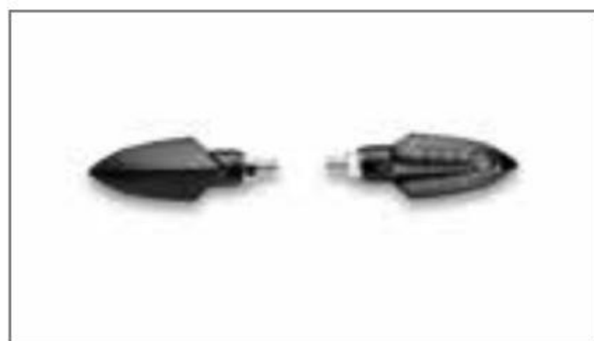
LED Flashers YME-H0789-00-20