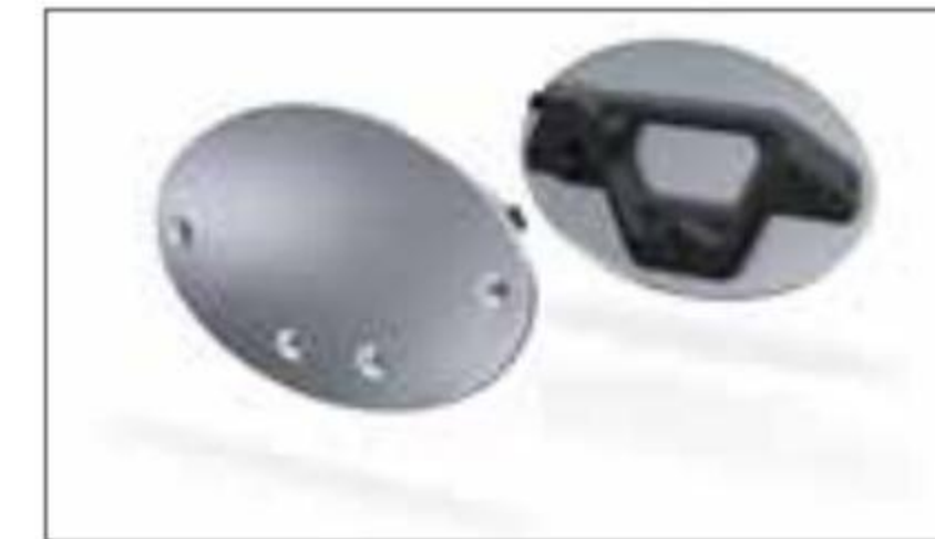
XSR Number Plate Left BEE-F3485-L0-00