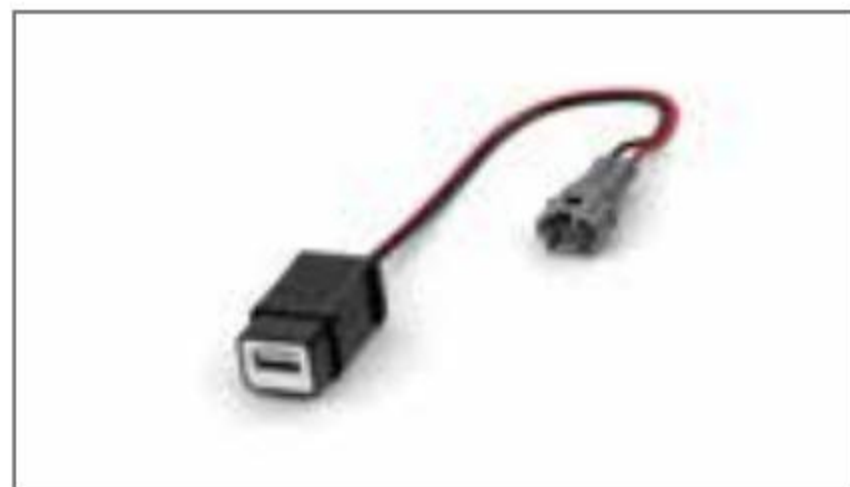
USB Charger Outlet B5U-H6600-00-00