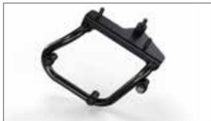
Soft Bag Carrier Right BEA-F84M0-R0-00