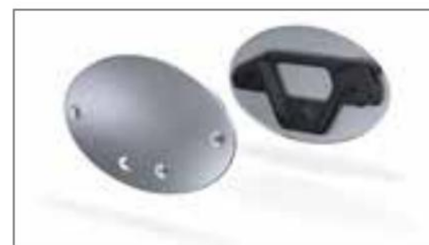
Number Plate Right BEE-F3485-R0-00