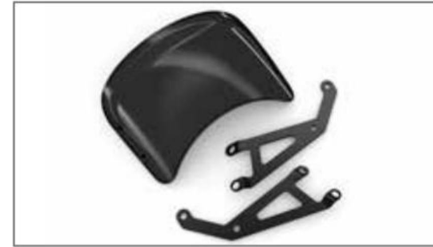
Retro Style Fly Screen B1V-F74A8-M2-SM