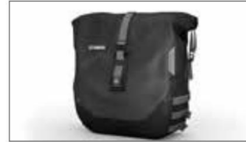
XSR Soft Side Bag Right BJV-FSSBH-R0-00