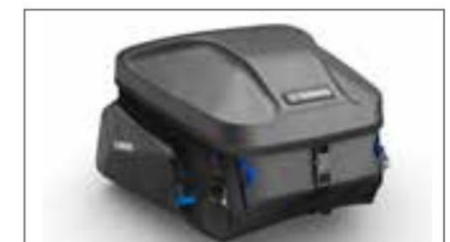
Rear-Seat Bag YME-REARB-AG-01

Above is a selection of bolt-on accessories available. Please contact your local Yamaha dealer for a full list of accessories and to advise you on the best accessories set-up for your Yamaha. Full list of accessories is also available on our website.