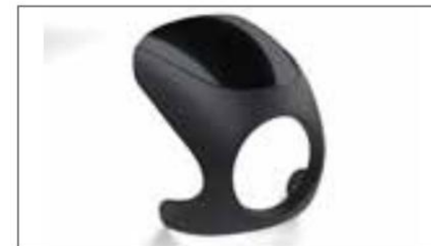
Retro-Styled Racer Cowl B1V-SH414-M2-BL