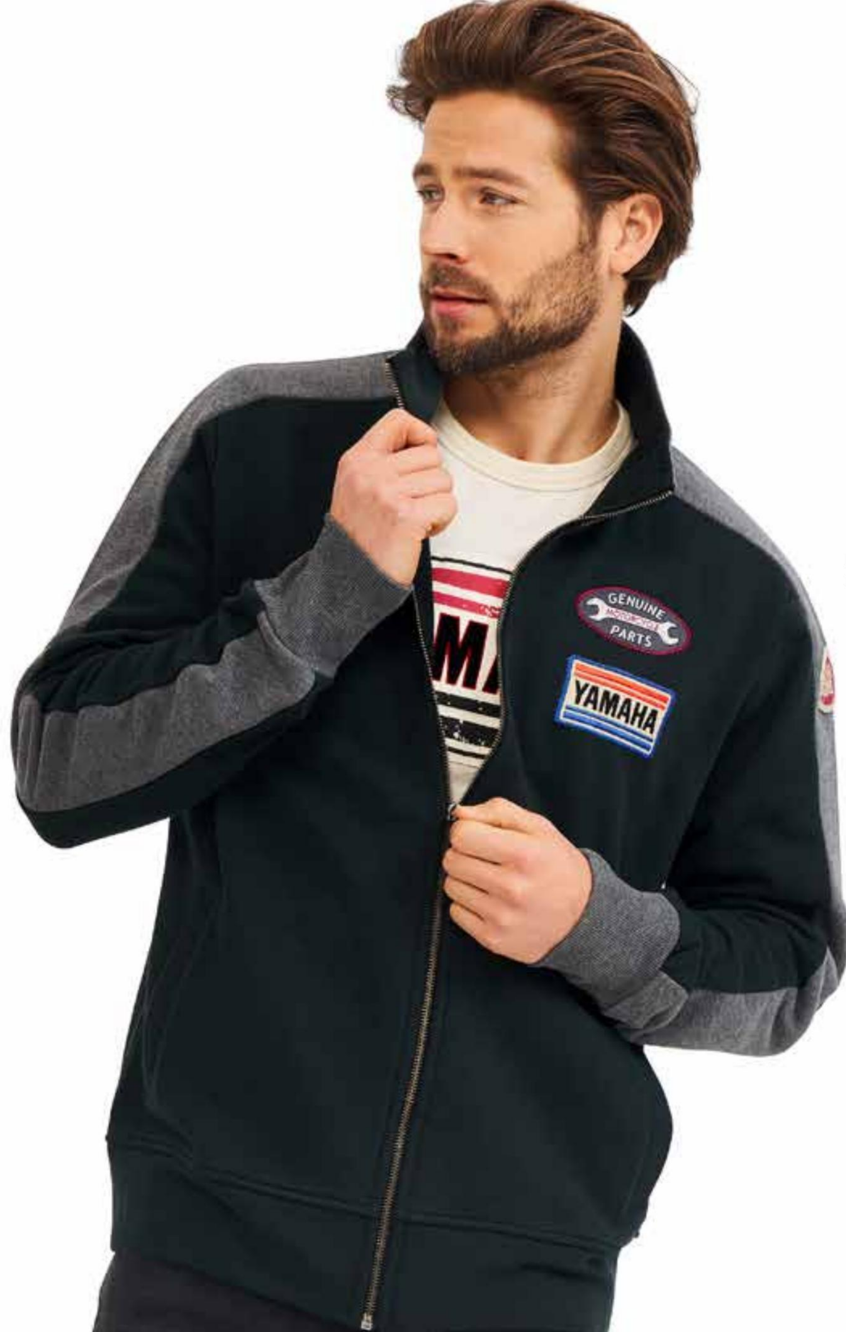
Faster Sons Zip Sweater B21-FS103-B0