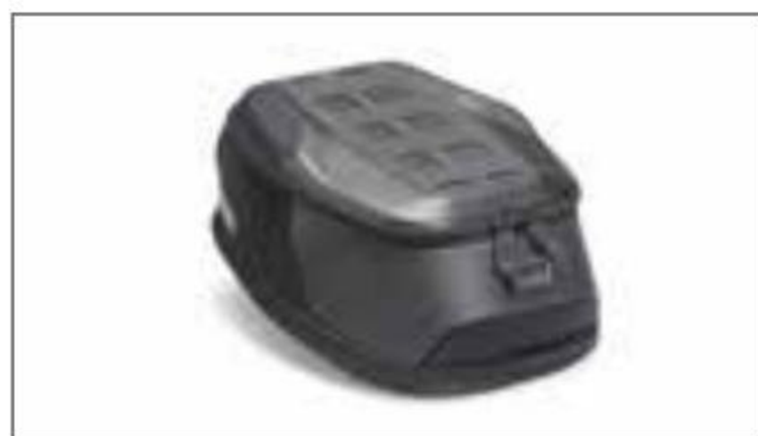
Tank Bag Sport YME-FTBAG-SP-02