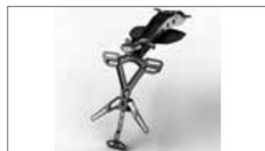
Sporty XSR License Plate Holder BEA-FLPH0-00-00