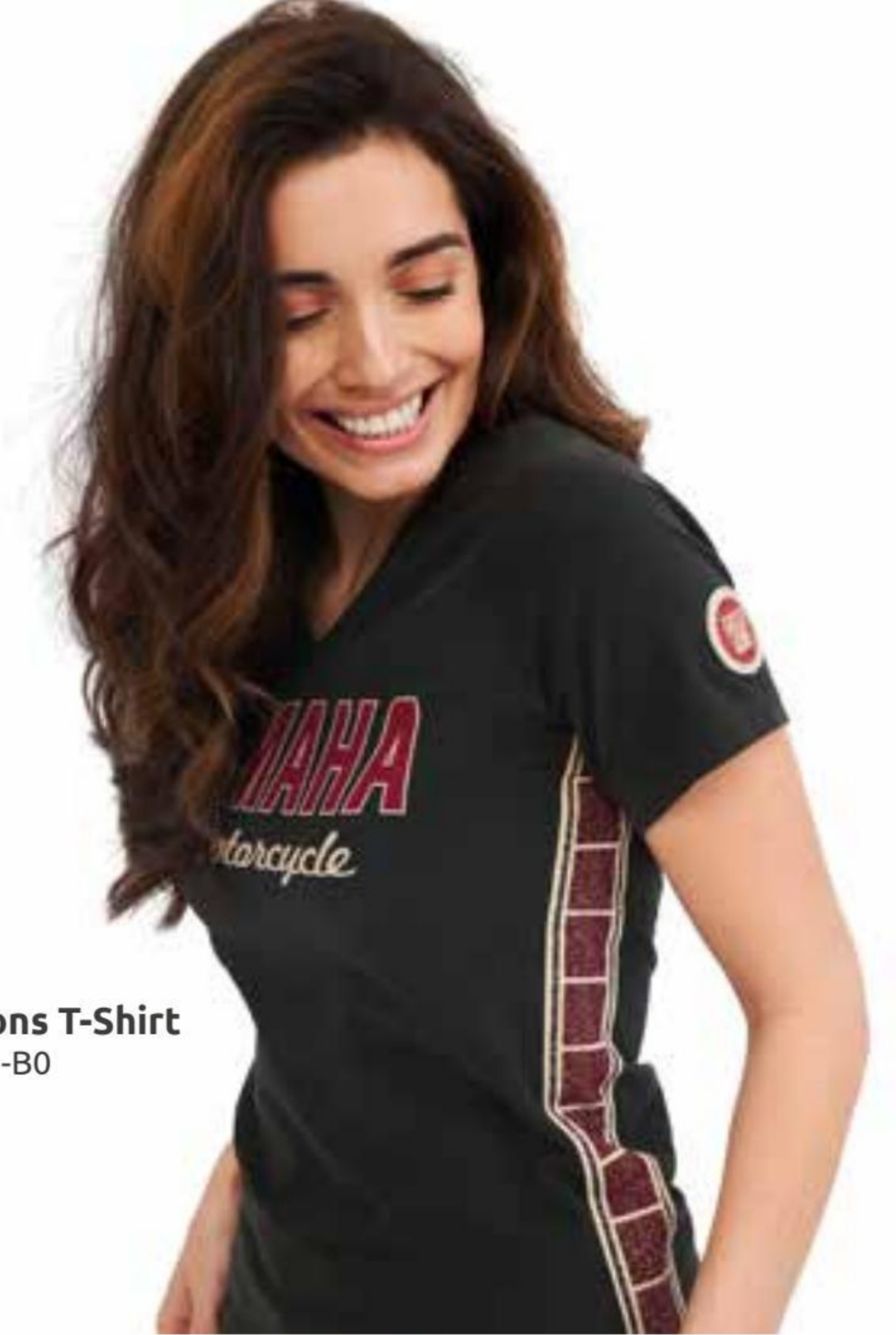
Faster Sons T-Shirt B21-FS201-B0