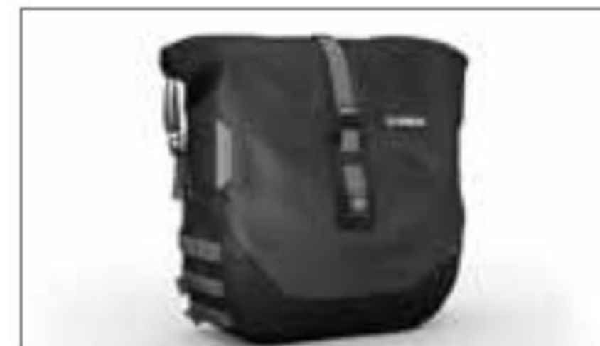
Soft Side Bag Left BJV-FSSBH-L0-00