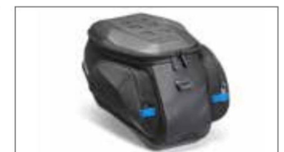
Tank Bag Urban YME-FTBAG-CT-02