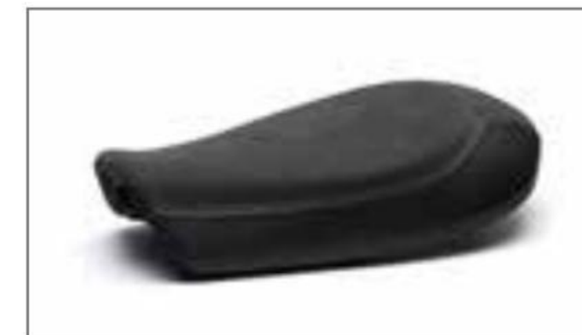
Single Seat B34-F4710-00-00