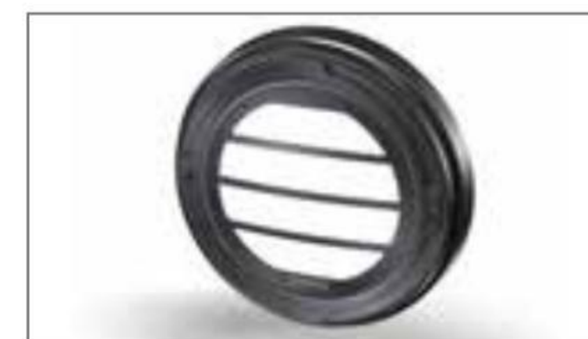
Headlight Grill BEA-84105-00-00