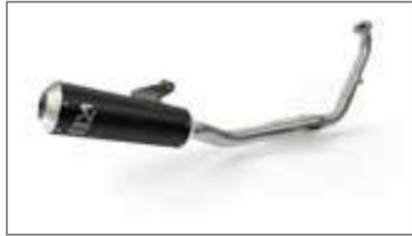
Full Akrapovic Exhaust90798-34201-00