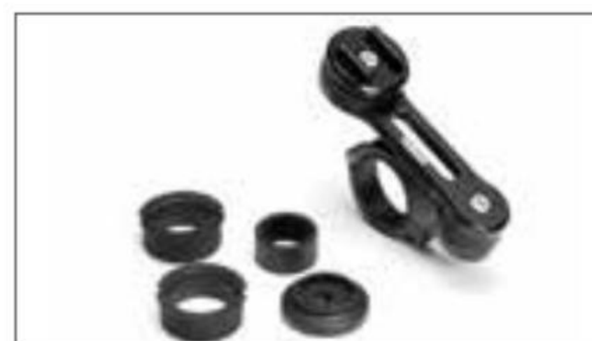
Bar Mount YME-FMKIT-00-00