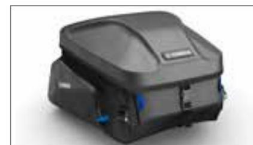
Rear-Seat Bag YME-REARB-AG-01