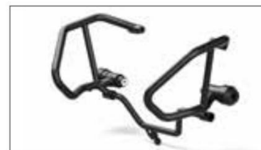
Engine Guard B4T-F11D0-00-00