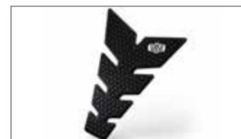
XSR-Style Tank Pad BEA-FTPAD-00-00