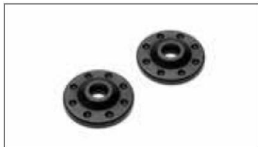
Front Axle Covers B34-FFAXC-00-00