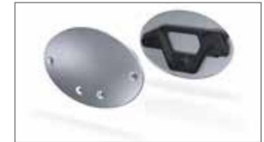
XSR Number Plate right BEE-F3485-R0-00