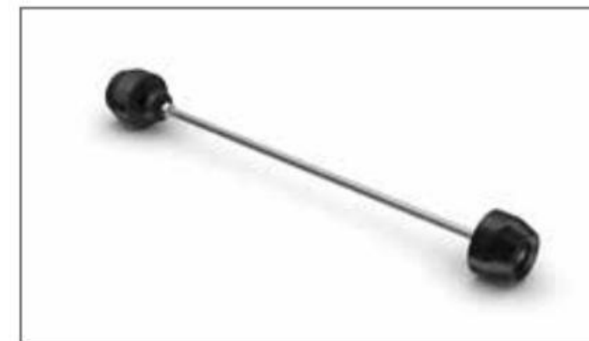
Rear Axle Protector B7N-FRAXP-00-00