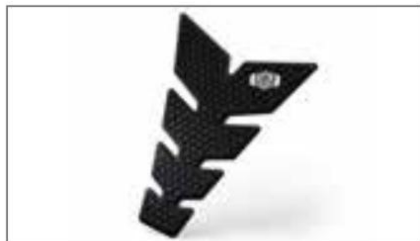
XSR-Style Tank Pad BEA-FTPAD-00-00