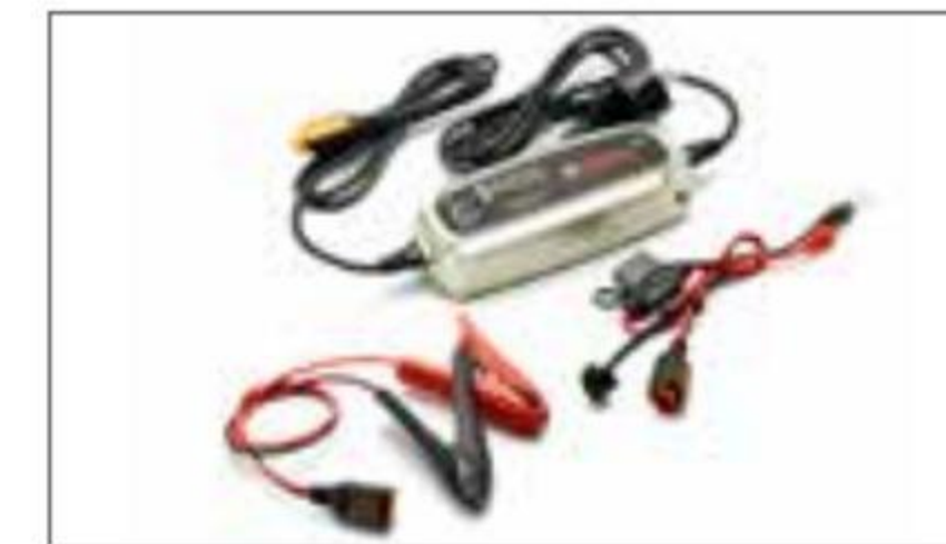
YEC-50 Battery Charger YME-YEC50-UK-00