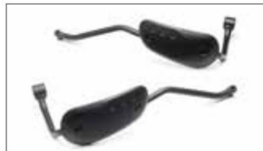
Knuckle Guards B34-F85F0-00-00