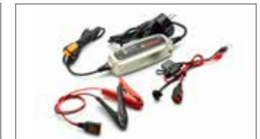
YEC-9 Battery Charger YME-YEC08-UK-00

Above is a selection of bolt-on accessories available. Please contact your local Yamaha dealer for a full list of accessories and to advise you on the best accessories set-up for your Yamaha. Full list of accessories is also available on our website.