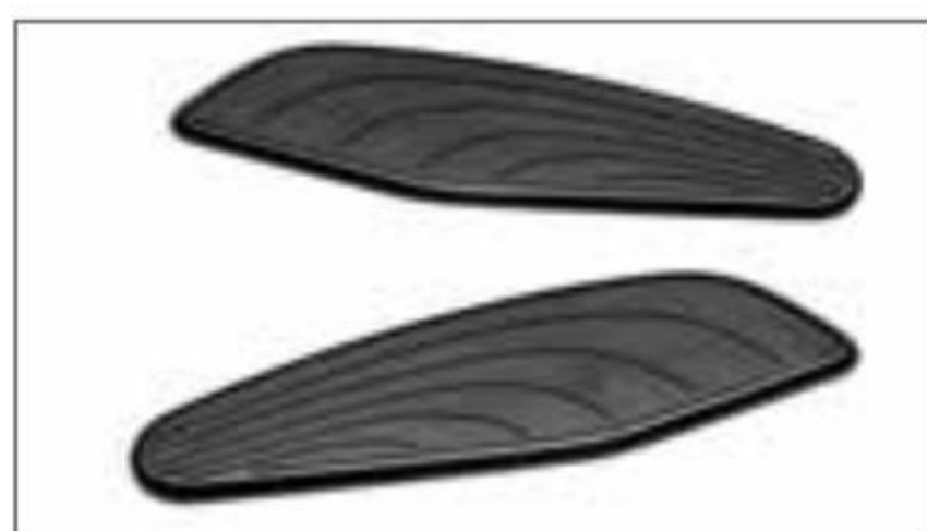
Side Tank Pads B34-F41D0-00-00