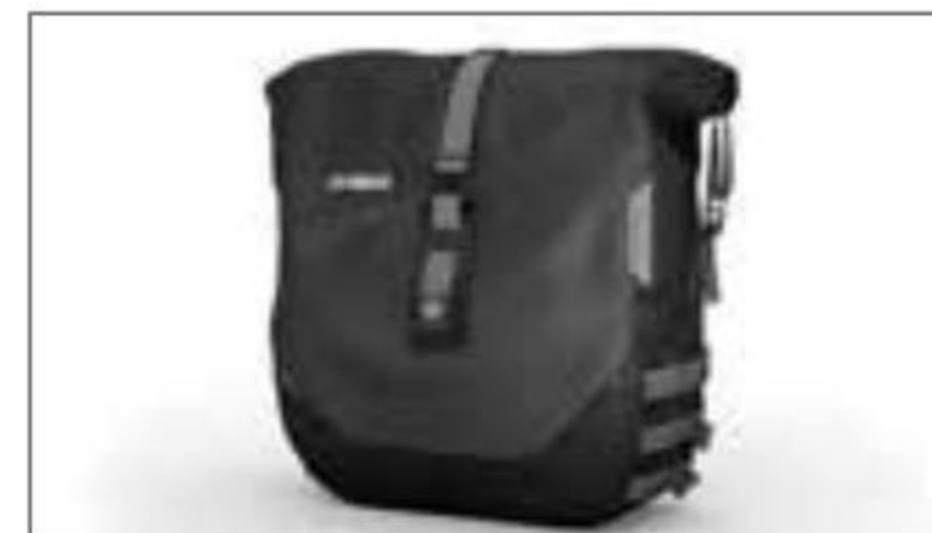
Soft Side Bag Right BJV-FSSBH-R0-00