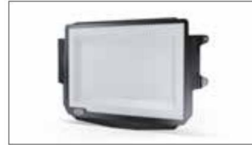
Radiator Guard BEA-FRADC-00-00