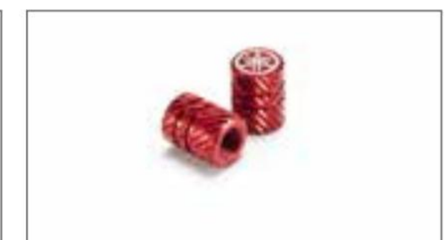
Aluminium Valve Cap Helical Pattern 90338-W1018-RE