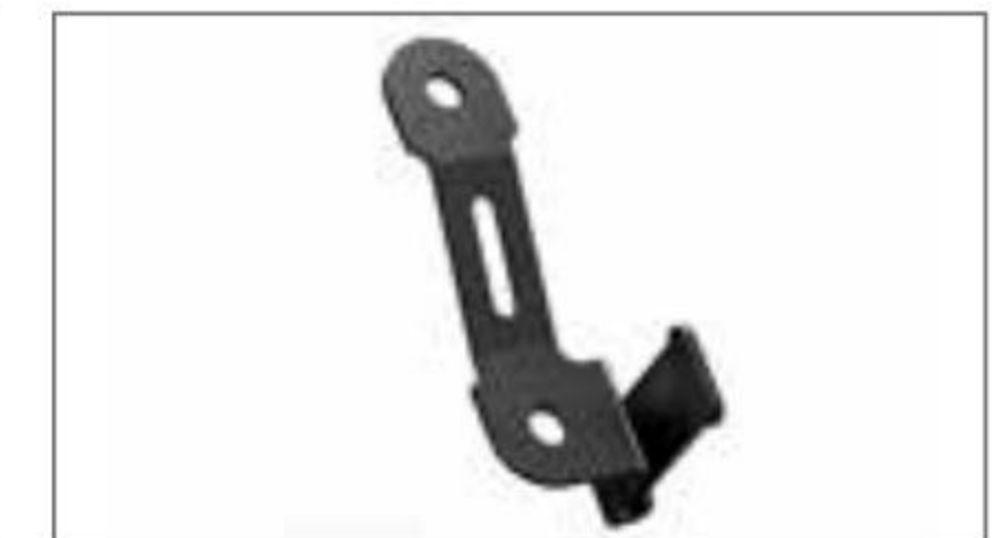
USB Mounting Bracket BEA-H21D0-00-00