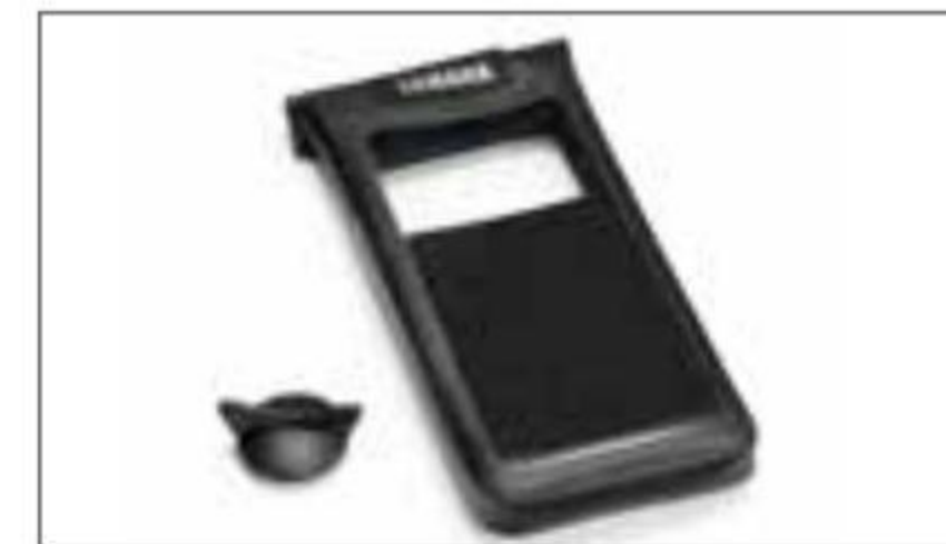
Universal Case YME-FUNVC-00-00