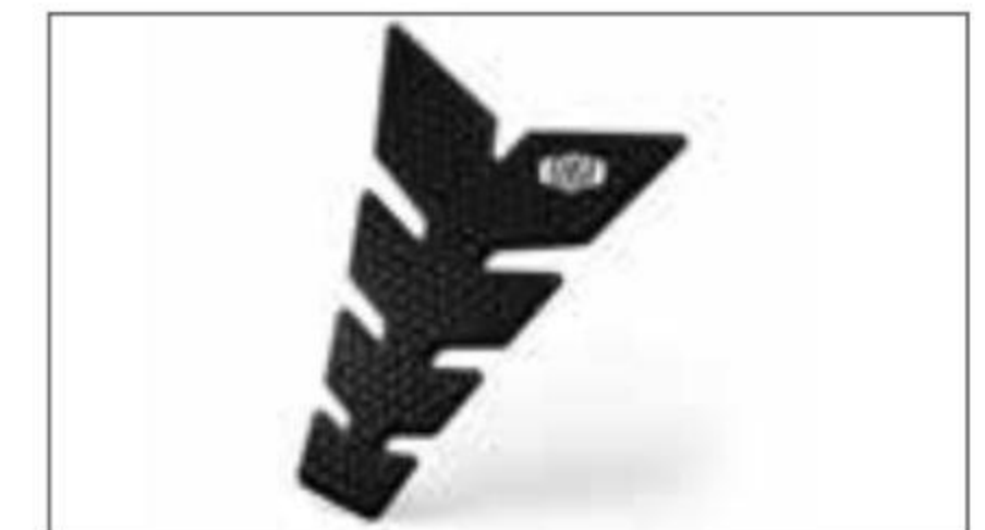
XSR-Style Tank Pad BEA-FTPAD-00-00