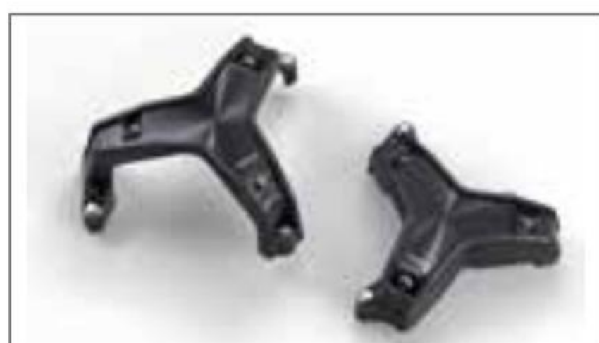
Engine Protector/Slider Kit BEA-211D0-00-00