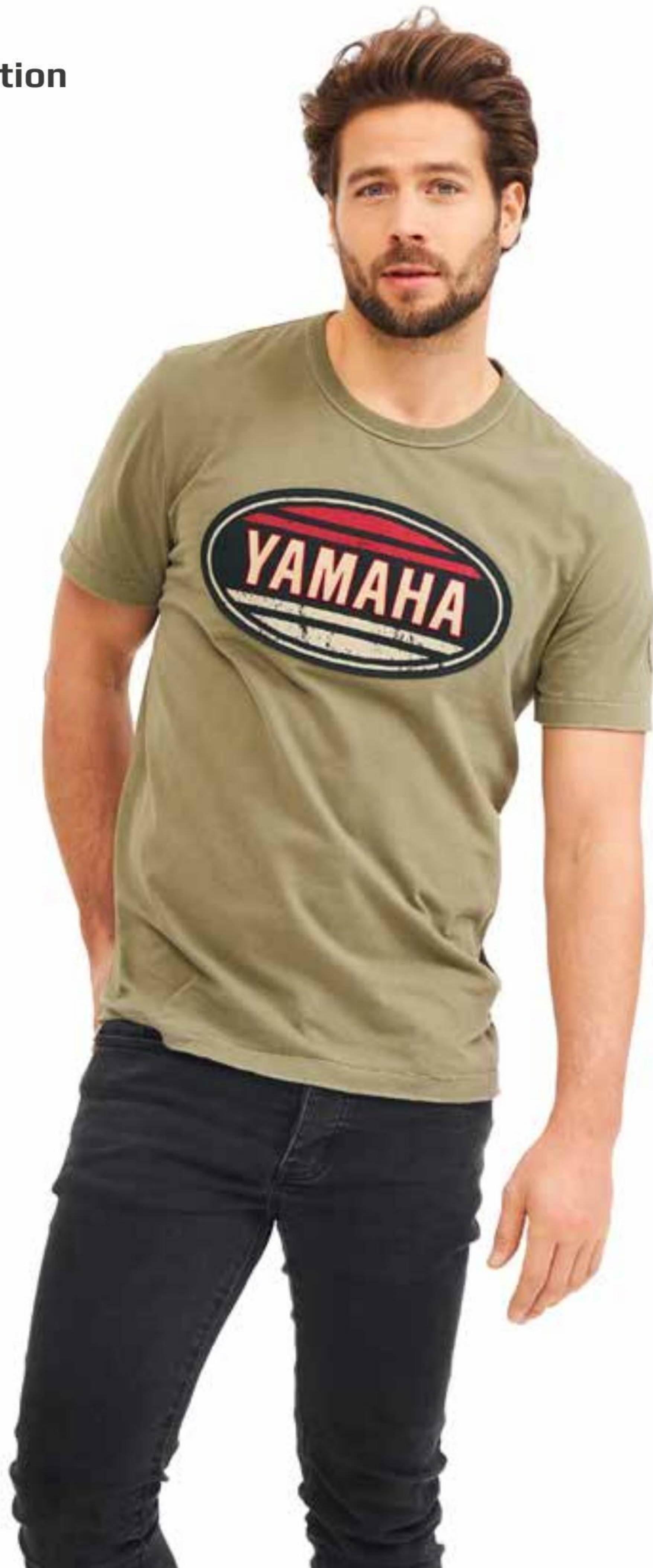
Faster Sons T-Shirt B21-FS102-G0