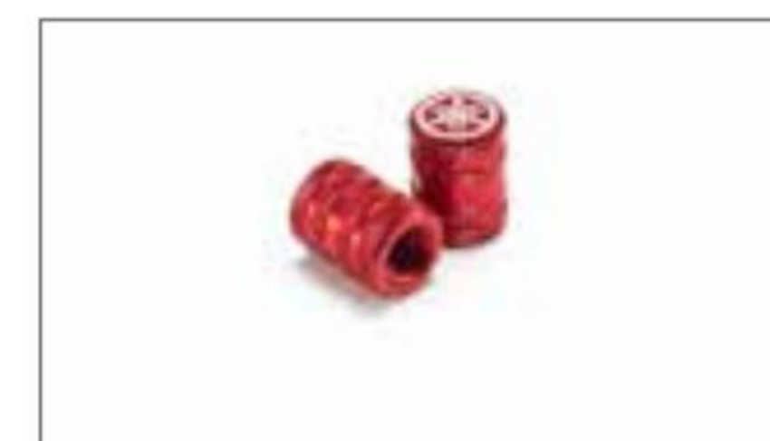
Aluminium Valve Cap Knurled Pattern 90338-W1016-RE