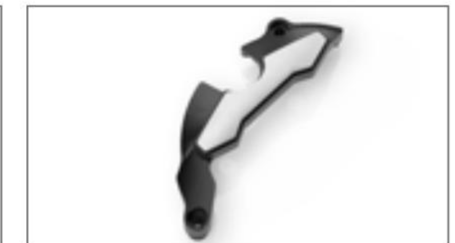
Left Engine Protector B7D-E5421-M3-SB