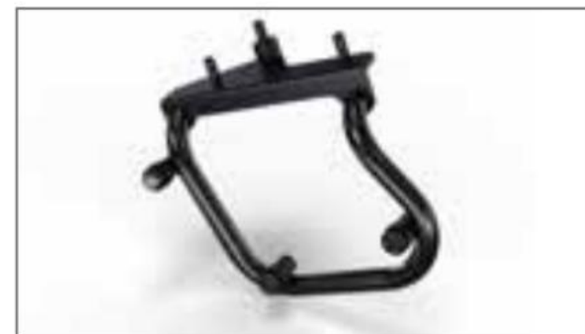
Soft Bag Carrier Left BEA-F84M0-L0-00