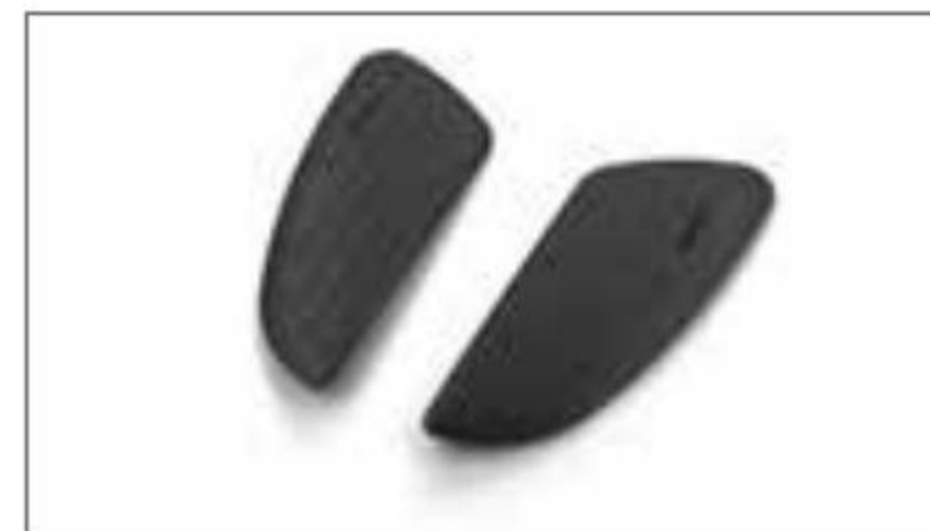
Retro Styled Side Tank Pads with YAMAHA logo B1V-SFUEL-M4-BL