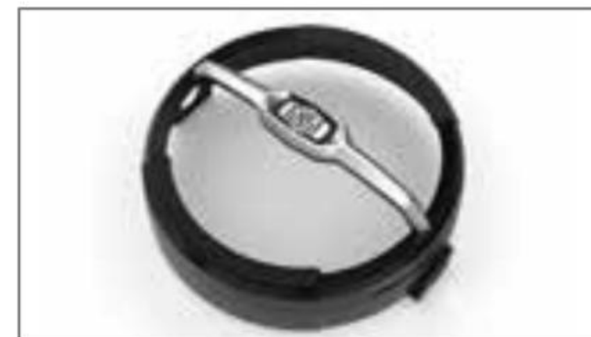
Headlight Cover in Retro Styling B1V-H4144-M2-BL