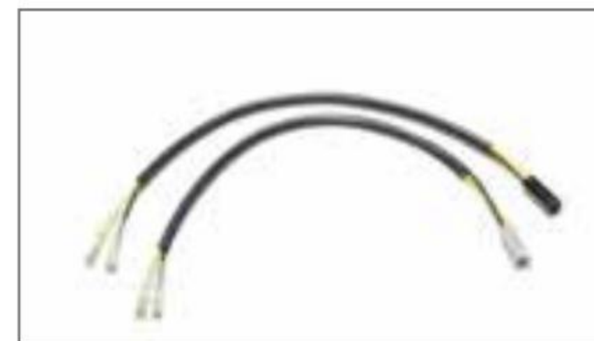
Wire Harness for LED blinkers BK6-FCABL-00-00