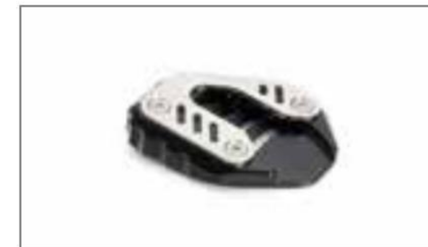
Side Stand Base Extension Kit B34-FSISI-00-00