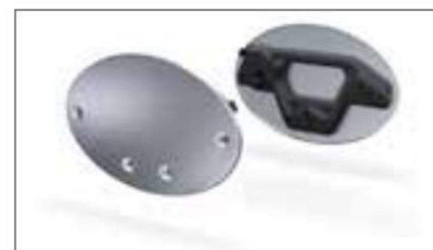
Number Plate Left BEE-F3485-L0-00