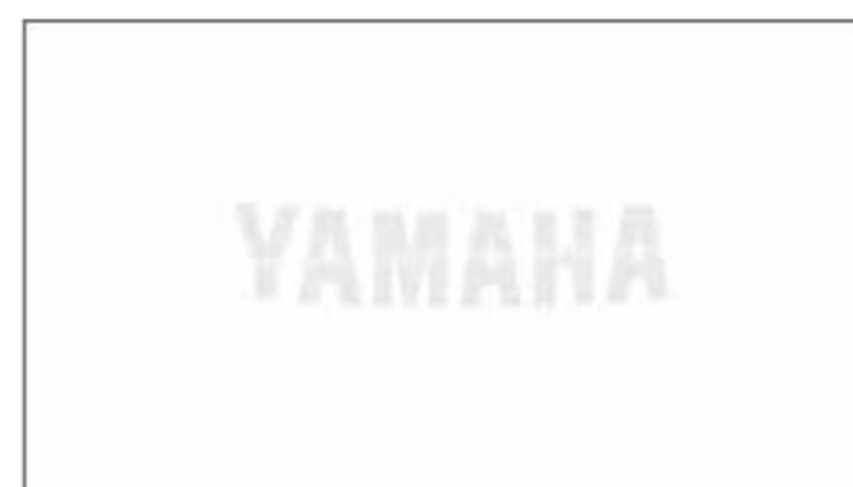
Reflective Rim Sticker for 1 Wheel (Front) YME-FSGEN-10-01