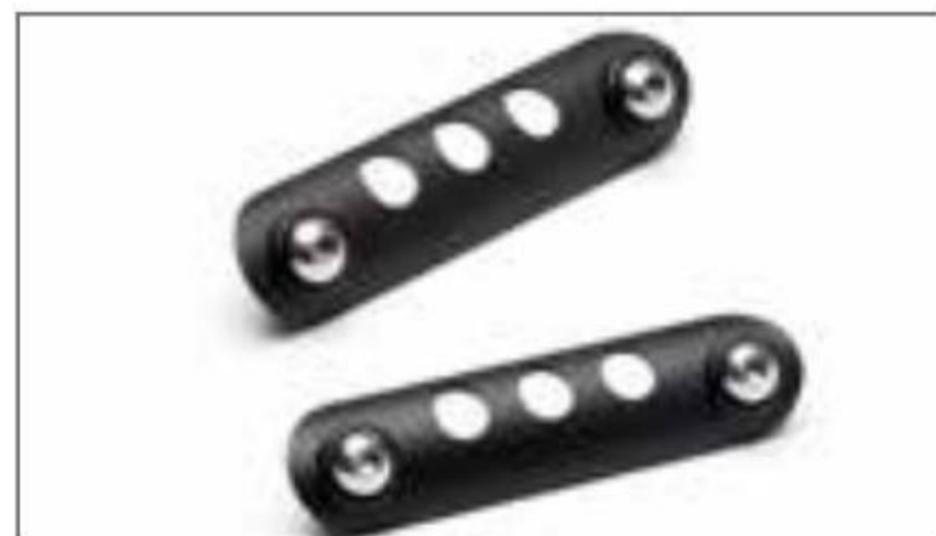
Billet Passenger Footrest Covers B34-FPPRC-00-00