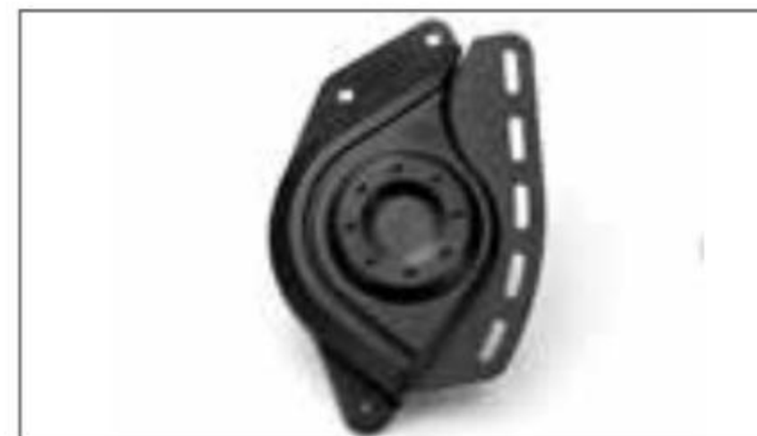
Billet Sprocket Cover B34-FSPRC-00-00