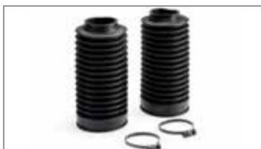
Fork Gaitors B34-F31K0-00-00