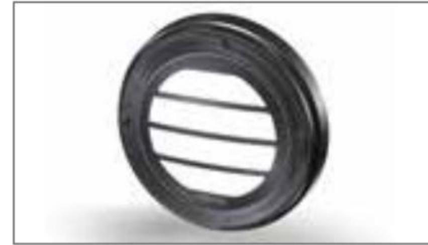
Headlight Grill BEA-84105-00-00