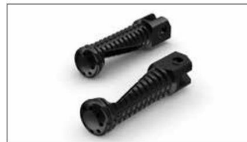
Billet Footpeg Rider B7N-FRPEG-00-00