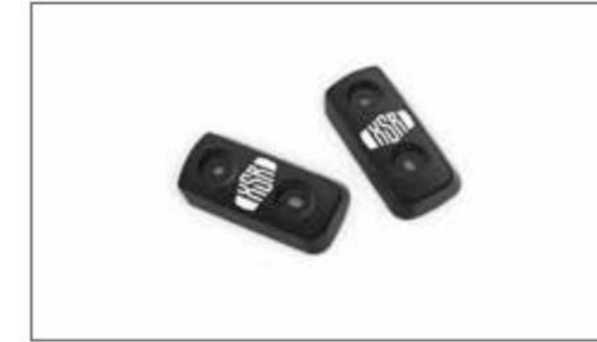
Stamped Aluminium Radiator Cover Set B1V-SGUAR-M3-BL