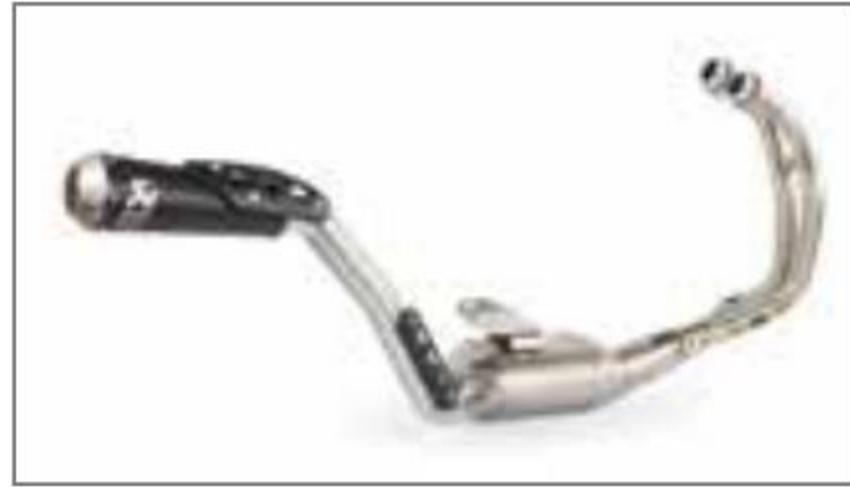
High-Mounted Exhaust System 90798-33454-00