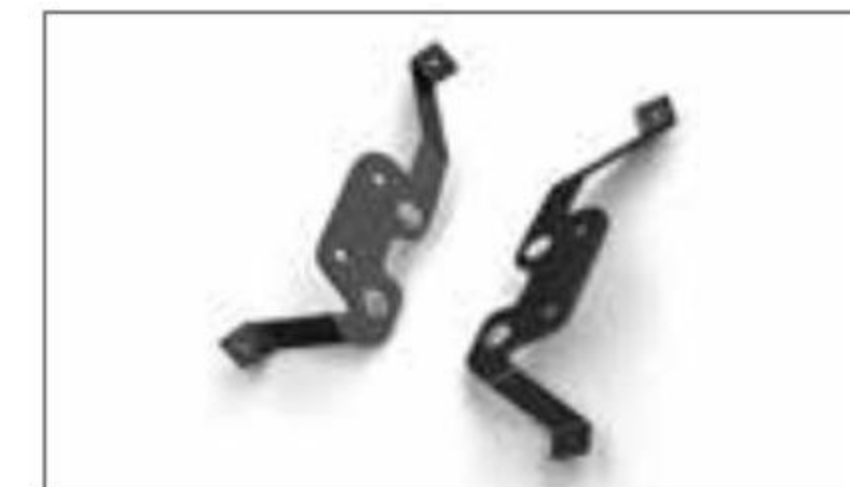
Retro-Styled Stays for Mounting the Racer Cowl B1V-SSTAY-M1-BL