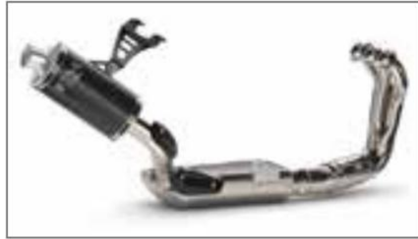
Full Akrapovic Exhaust System 90798-34503-00