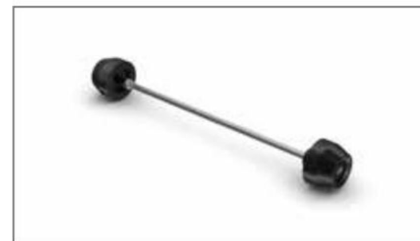
Front Axle Protector B7N-FFAXP-00-00