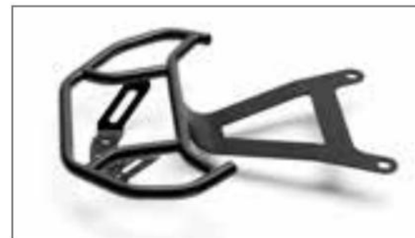
Rear Rack B34-F48D0-00-00