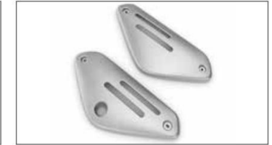
Side Cover Set B1V-SF171-M3-SV