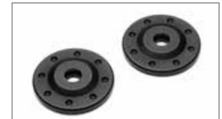
Rear Axle Covers B34-FRAXC-00-00