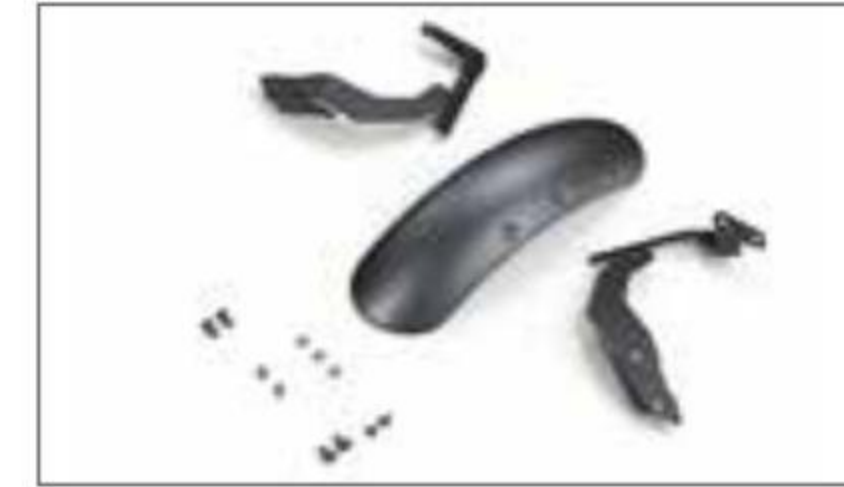
Aluminium Front Fender BEA-F15L0-00-00