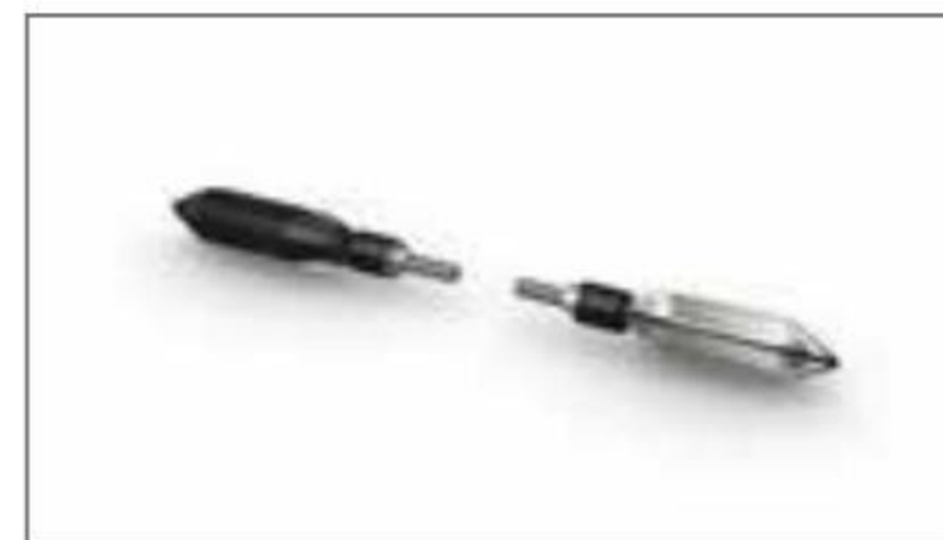
LED Flashers Plus Rear YME-FLB2R-10-00