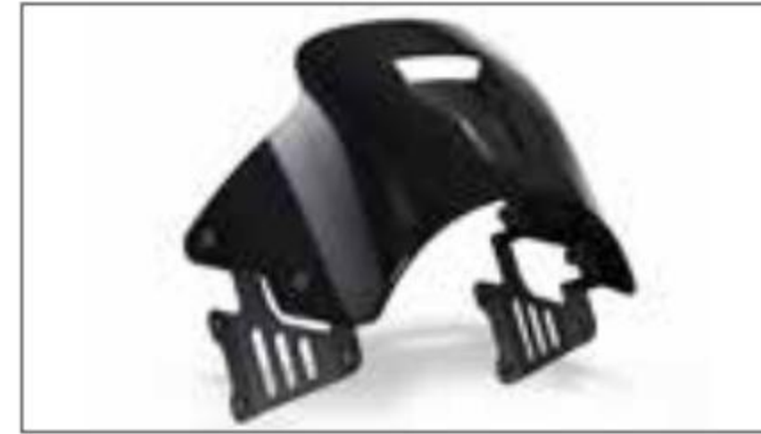
Cockpit Visor BEA-F83J0-A0-10