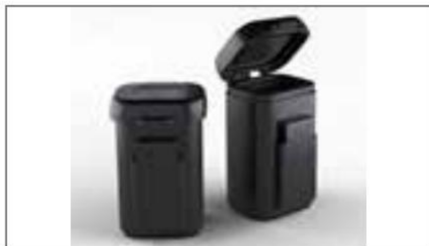
USB Adapter Mounting Rubber BEA-H21K0-00-00