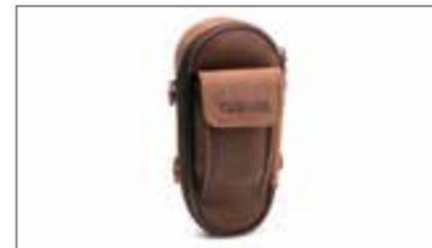
Tank Bag - Sport Heritage B34-FSMTB-00-00