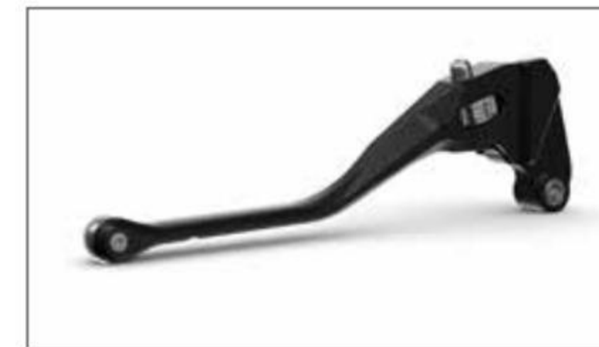
Clutch Lever Black B7N-RFFCL-00-00